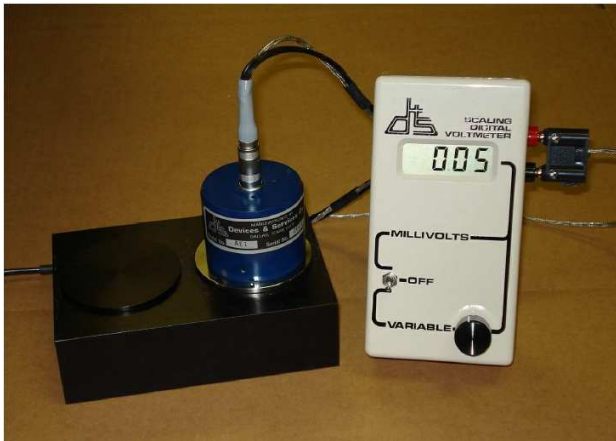
The D&S Model AE1 Emissometer with the Model RD1 Scaling Digital Voltmeter